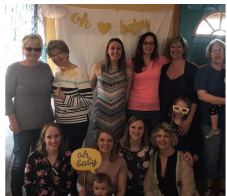
We focus on what matters to make every adoption a beautiful experience.