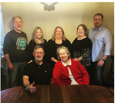
We focus on what matters to make every adoption a beautiful experience.