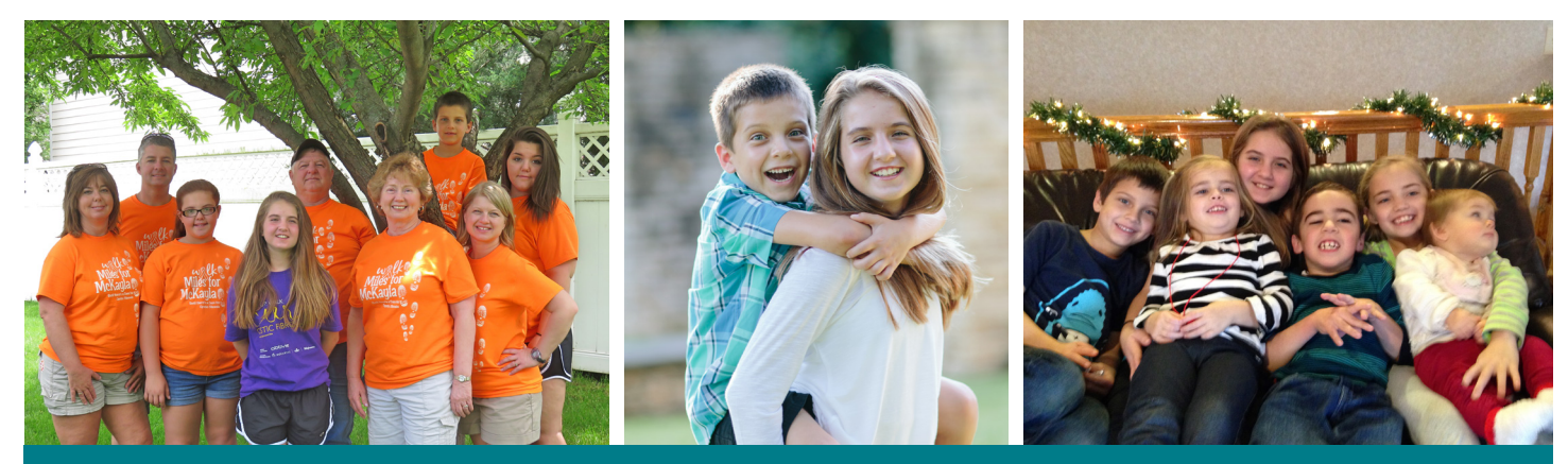
We focus on what matters to make every adoption a beautiful experience.

Our family of four is excited to add a brother or sister to the family. Grandparents, aunts, uncles, cousins, and friends will be overjoyed as well! They are just as eager as we are to include another family member.